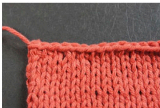
A better bind-off!

Ta da! After you bind-off the last (now newly) neaten stitch, your edge will look beautifully flat and tidy bind-off shown in the photo at right.